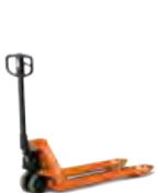
Hand Pallet Trucks

Toyota Material Handling is the forklift leader in Australia's fresh fruit and vegetable markets.