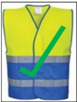
BUYERS VEST YELLOW & BLUE

It is a requirement that all Market stakeholders wear Hi-Vis Vests, such as, Yellow, Orange or Yellow & Blue (buyers vests) which meet current Australian Standards AS/NZS 4602.1:2011 and AS/NZS 1906.4:2010 , all other coloured vests are non-compliant.