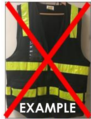
EXAMPLE BLACK VEST NON-COMPLIANT

Vests which do not meet current Australian Standards are NOT acceptable within the Sydney Markets site.