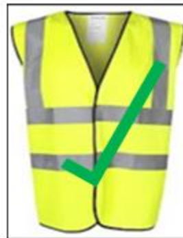
YELLOW VEST DAY/NIGHT