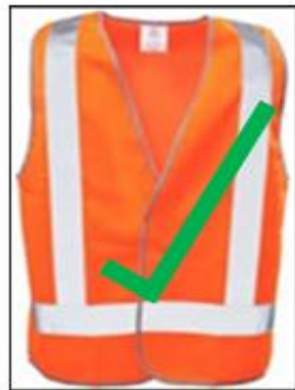
ORANGE VEST DAY/NIGHT