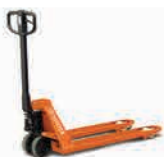
Hand Pallet Trucks

To make the smart choice and discover how Toyota Material Handling can make a difference to your operations, contact your local branch.