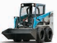
Skid Steer Loaders